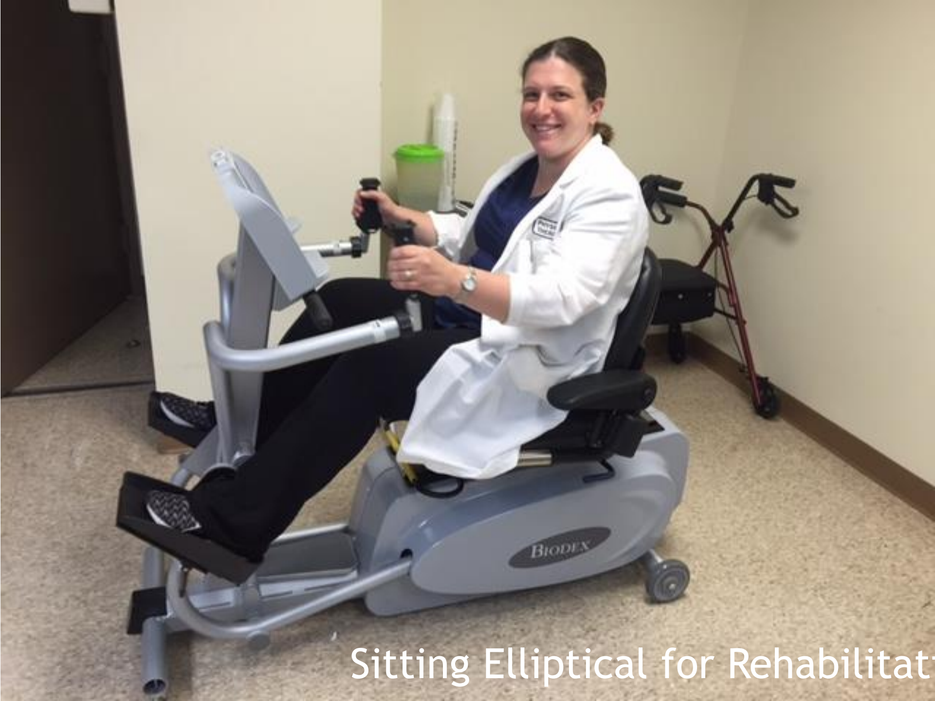
Sitting Elliptical for Rehabilitation