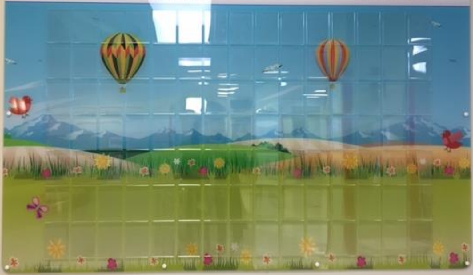
Staff Photo board for the Children's Health Center